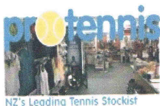
NZ's Leading Tennis Stockist

Pro Tennis provides friendly and expert stringing services at Scarbro Tennis Centre (5289782) and 1 Tennis Lane Parnell (373 2621). We focus on rackets, apparel, shoes and accessories that work for you, your training and your game. Scarbro opening hours are from 7 am to 10 pm weekdays and 8 to close on weekends.